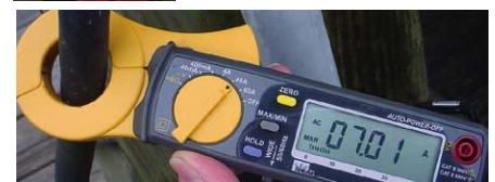
Top: An inexpensive circuit tester. Bottom: This clamp meter shows a 7-amp difference between the current going into the boat and coming out.